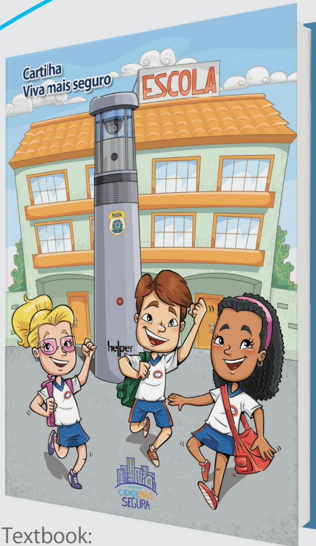
Textbook: educational content and games